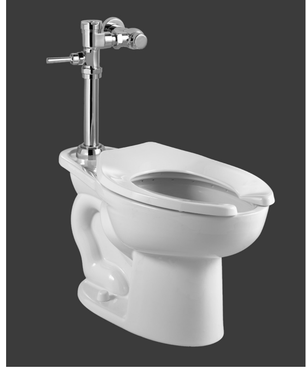
SEE REVERSE FOR ROUGHING-IN DIMENSIONS