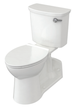
209AA138 Combo with Seat 5055A65C

SEE REVERSE FOR ROUGHING-IN DIMENSIONS AND PRODUCT SPECIFICATIONS