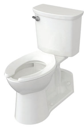
209AA137 Combo with Seat 5901100