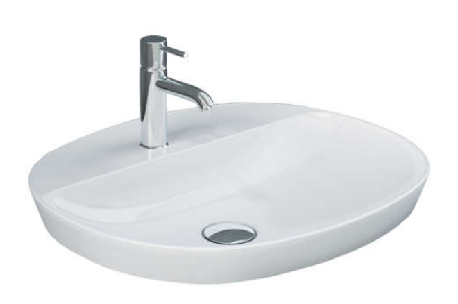
Faucet not included