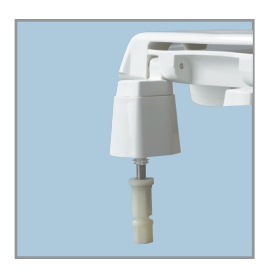
STA-TITE® COMMERCIAL FASTENING SYSTEM™