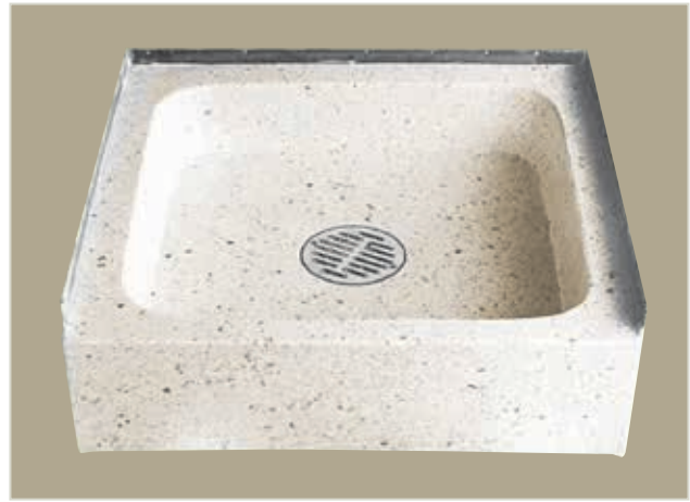
Shown: Model 40

FLORESTONE PRODUCTS CO., INC. 2851 Falcon Drive • Madera, CA 93637 T. 559.661.4171 • T. 800.446.8827 F. 559.661.2070 • floestone.com