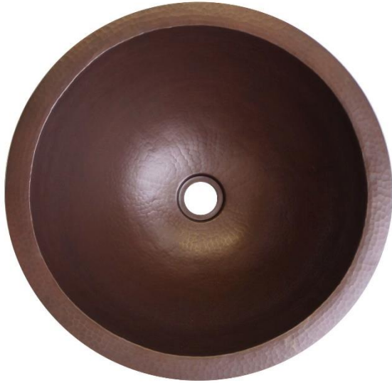
Shown in DB