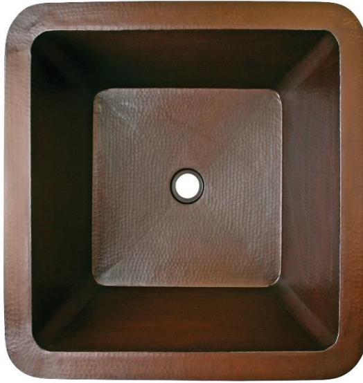
Shown in DB