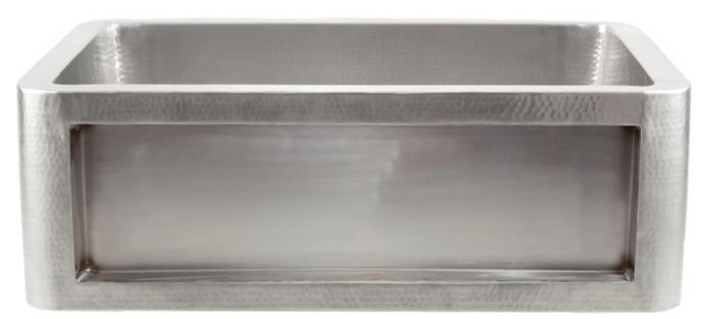
Shown in SS