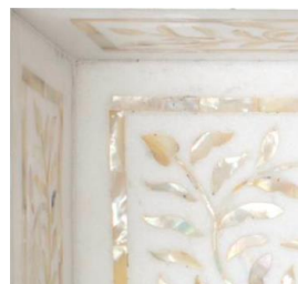
Mother of Pearl color will vary from sink-to-sink