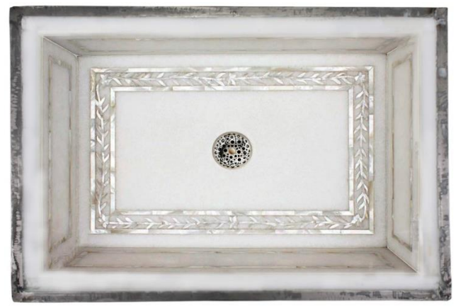
MI10 W shown with D017 PS-SCR02-N drain